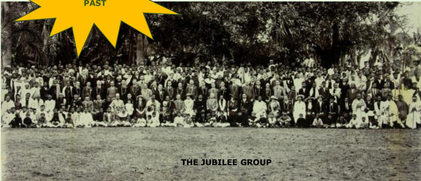
THE JUBILEE GROUP