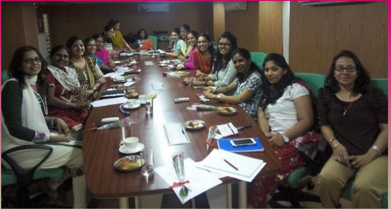
On the occasion of International Women's Day, RHR - WR organised a session on 'Holistic Health Care for Women' in association with doctors from Nanavati Hospital Mumbai on 9 th March 2015.