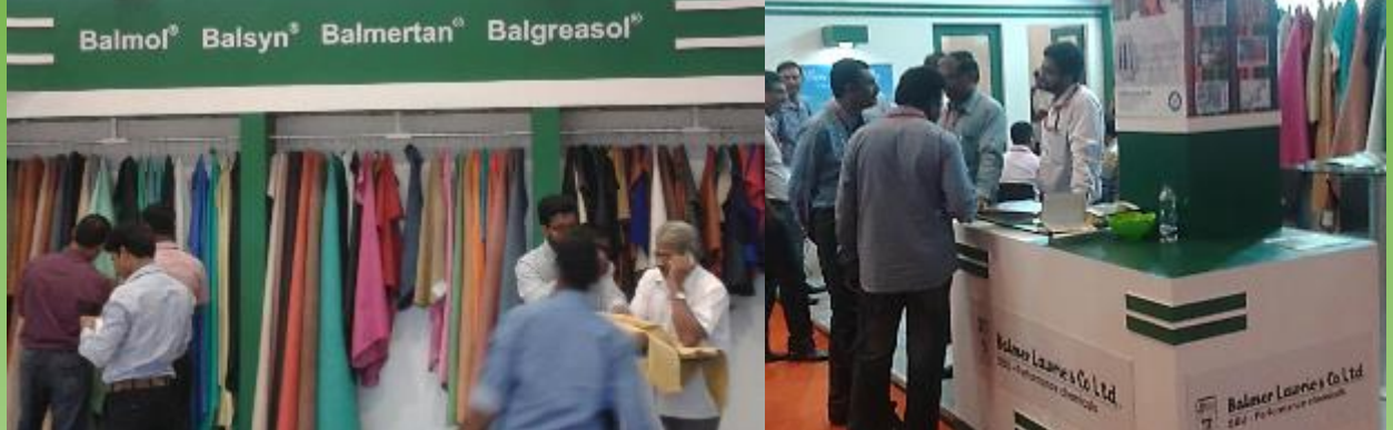
SBU: PC participated in 30 th India International Leather Fair held at Chennai Trade Centre in February 2015.