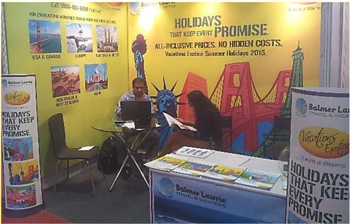
SBU:T&V participated in India International Travel Mart (IITM), a premier travel & tourism exhibition of the country, held in Kolkata from 20 th to 22 nd February. The stall put up at the exhibition showcased the Vacations Exotica Summer Holidays 2015 packages.