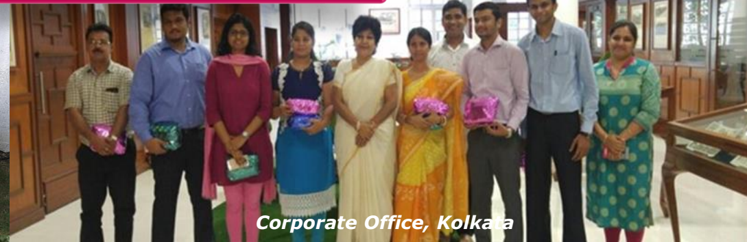
Corporate Office, Kolkata