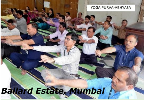
Ballard Estate, Mumbai