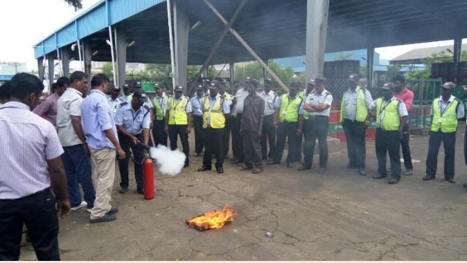
A firefighting training for Security Guards at Manali, Chennai was organised on 26 th June 2016.