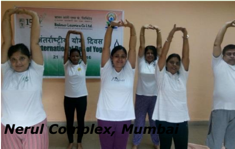
Nerul Complex, Mumbai