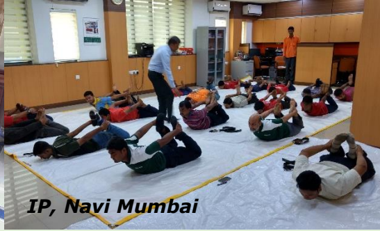
IP, Navi Mumbai