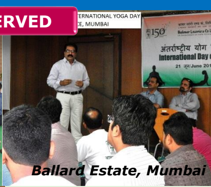
Ballard Estate, Mumbai