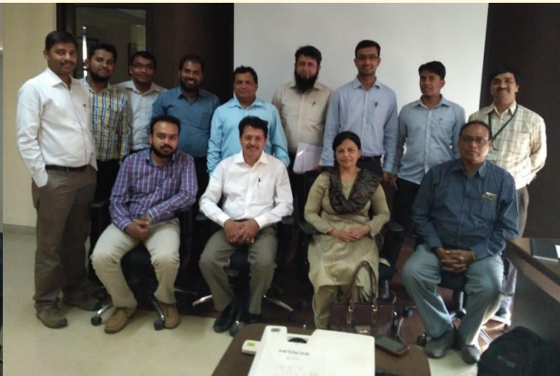
An e-Procurement training for vendors and employees was organized in Bangalore on 29 th December 2016.